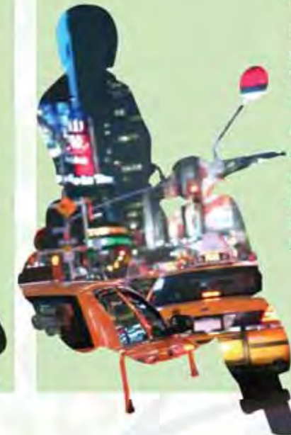
Neville Street Proprietor, Stella Six PR

I carry out the public relations work for the Green Achiever scheme.